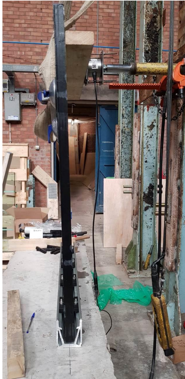
Plate 1 - Generic Test Configuration