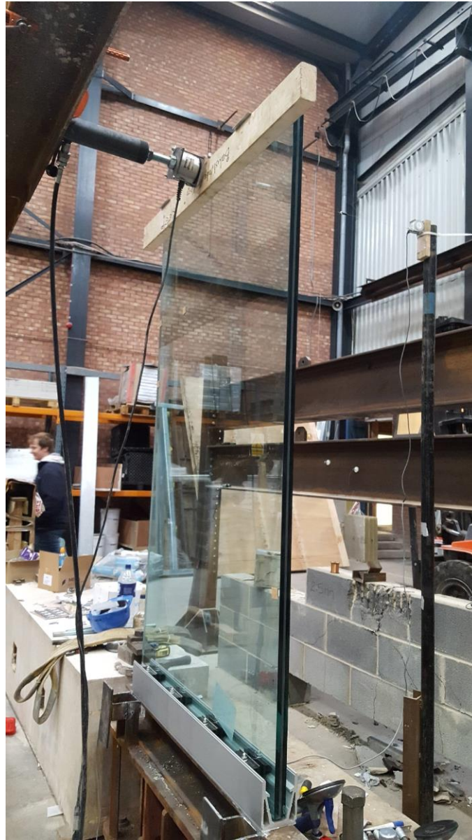
Plate 1 – Generic Test Configuration